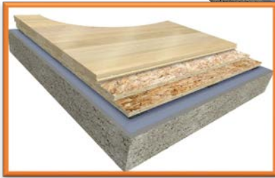
Option to specify Action Hardwood Premium Sheathing (HPS)

Action E-Cush 3/8" (10 mm) pad or optional 5/8" (16 mm) E-Cush pad