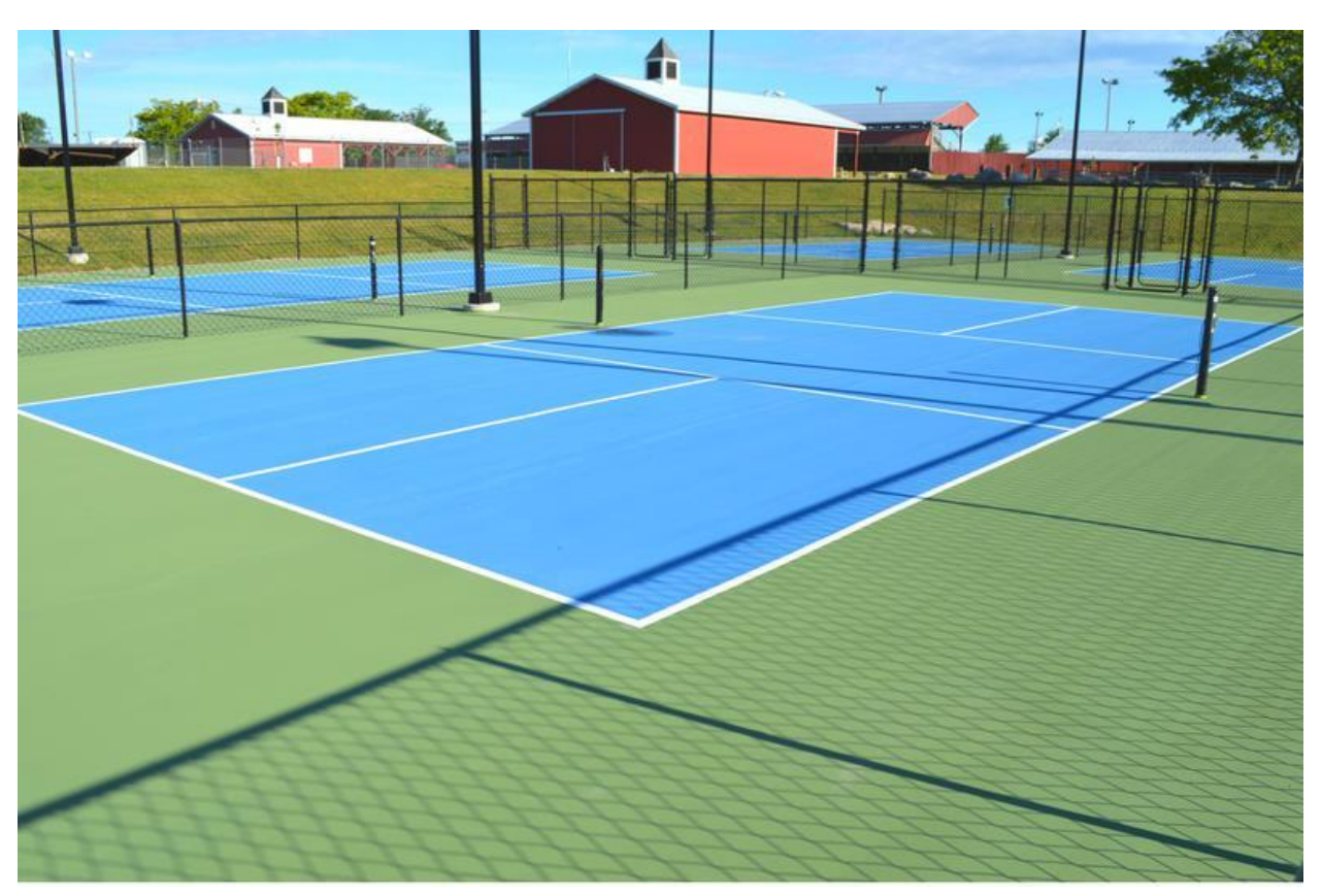
The Picklebowl Lake Odessa, MI