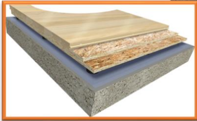
Option to specify Action Hardwood Premium Sheathing (HPS)